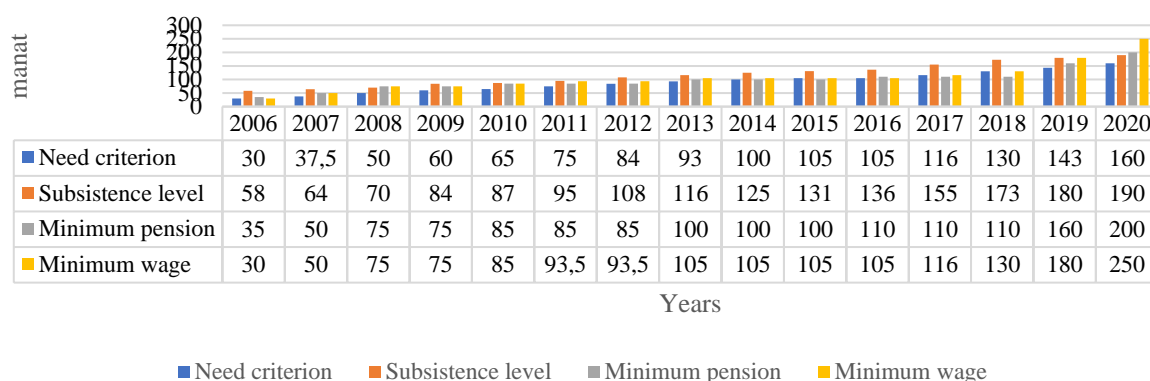
Graph 1. Some macro-statistical indicators related to the social security system (in manat, to the end of the year)

Most of the promises made by the government over the years in the state-building stages to ensure a targeted policy strategy have been fulfilled (graph. 1.).